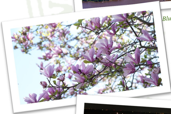
Blue Skies Over Chestertown