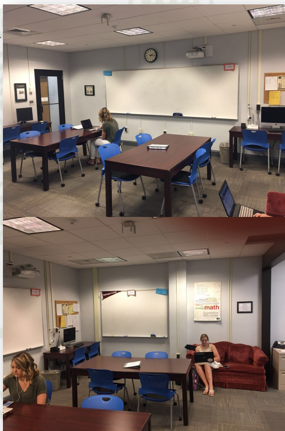
Two Views of the Quantitative Skills Center