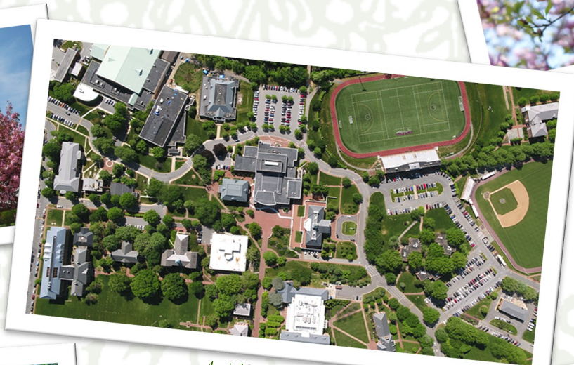
Aerial View of Campus