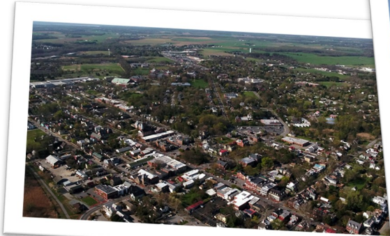
Small Town Chestertown