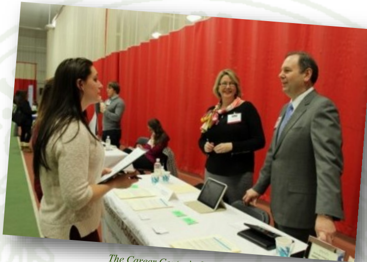
The Career Center's Career Fair

ary or career center named What can I do with my Major? It has a list of all majors offered by Washington College; by clicking each of these links we can see the possible job options for different majors in different areas with strategies. With this page, students will have a better understanding of the major they are planning to choose and what kind of career they can expect. In the senior year, we will face the final decision making. Either go graduate schools for further education or start to work. It will be good for both ways to have helped from alumni who can provide information about specific occupations in chosen career