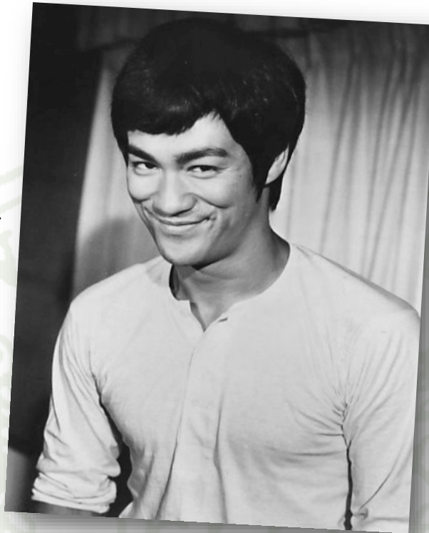
Bruce Lee from film "Fists of Fury"

When people talk about Chinese Kung Fu, the first person that comes to their minds is Bruce Lee. He was born in San Francisco, California, United States, but was raised in Kowloon, Hong Kong. He pioneered the world-wide revolution of martial arts and is also known as a master of martial arts, pioneer of Kung Fu film, the first global promoter of Chinese Kung Fu, and the first Chinese actor of Hollywood. The contribution that Bruce Lee had made to Chinese martial arts is extensive. Because of his enormous influence on Kung Fu, many people in the United States think everyone in China knows how to play Kung Fu.