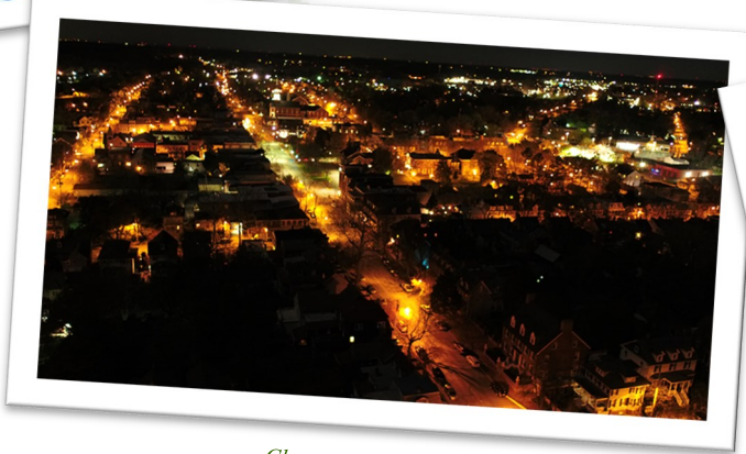
Chestertown at Night