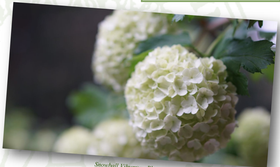
Snowball Viburnum Blossoms