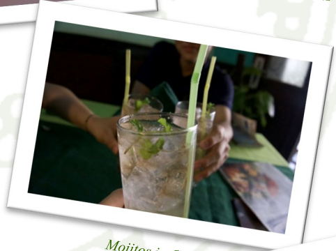
Mojitos in Cuba