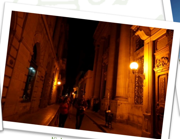
Nighttime Street in Havana