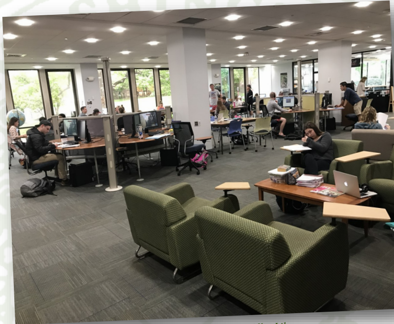
Students Studying for Finals in Miller Library

So, That's all my classes and what my finals looks like. Do you consider yourself lucky when you heard about my finals, or are my finals too easy when compared to yours?