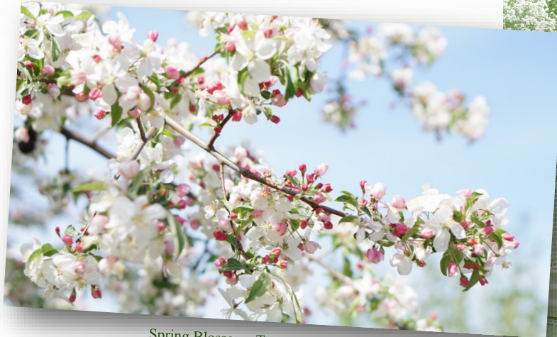
Spring Blossoms Turn to Summer Leaves

By late March, 2017, the winter seems completely finished. Washington College went through a short spring, then the summer of 2017 stealthily came. In Washington College, there are beautiful landscape and subtle season