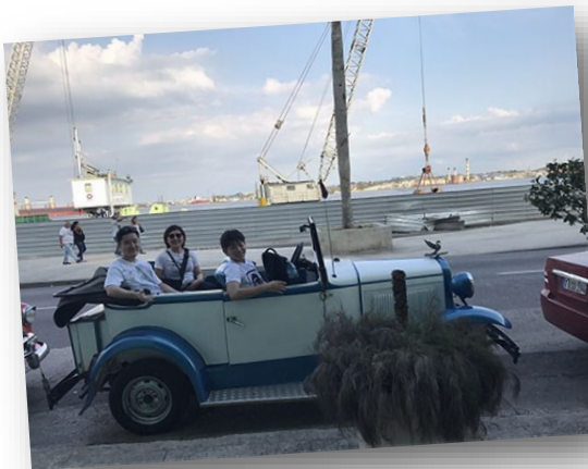
Classic Car in Havana

Cuba is a small island country located in the northern Caribbean. Recently, the number of tourists visiting Cuba is increasing year by year. More American have visited Cuba, especially since the United States and Cuba restored diplomatic relations in July 2015. In 2016, indeed, more than four million tourists visited Cuba (Cuba Business Report, 2017). During spring break, I went to Cuba with my Japanese friends. I would like to share some trivia that I found in Cuba.