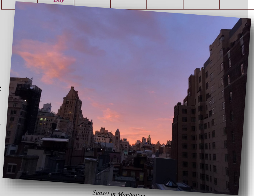
Sunset in Manhattan

Sunday was the day we should head back to Chestertown; the memories were priceless. New York City, see you next time!