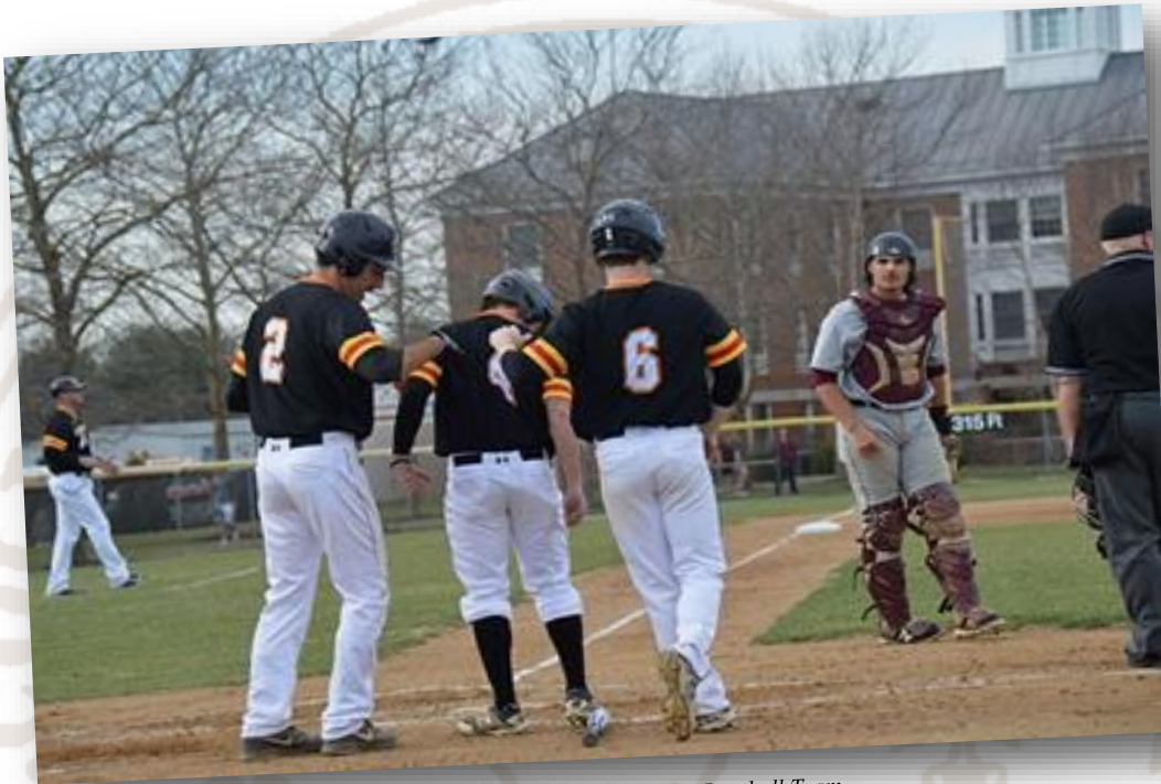
Washington College Shoremen Baseball Team

of time for the opponent team to score. Unhappily, after 2 hours long battle, the score stayed at 1:0 and the Shoremen did not gain the victory.