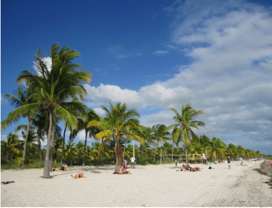
Palm Trees and Sand on Miami Beach

During spring break, I went to Miami, Florida with my friends. One reason why I chose this city to spend my spring break is that the weather in Miami is wonderful, it's like summer all the year round. To escape the cold weather in Chesertown, I think Miami was the best choice for us.