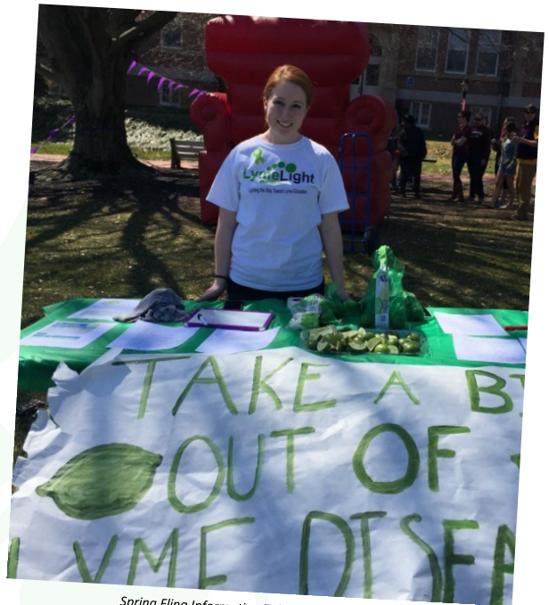
Spring Fling Information Table on Lyme Disease