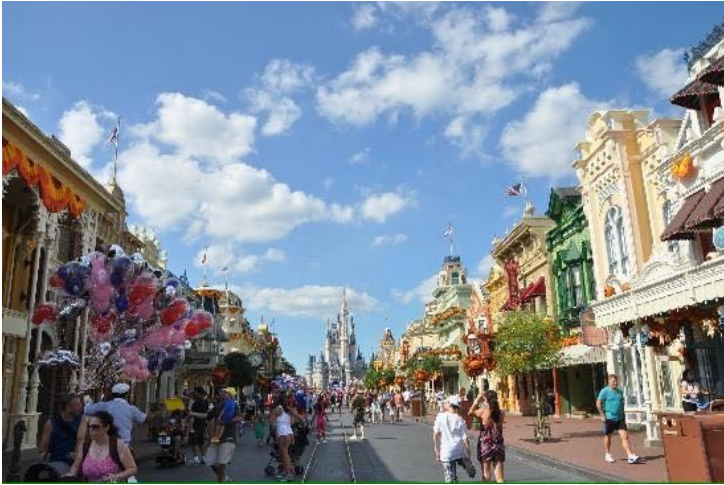
Main Street U. S. A.

During spring break in March, I went with my friends to one of the most popular places in America, Walt Disney World, located in Orlando, Florida. It is not just every kid's dream to be there and see the movie characters in person, but also it is a wonderland for families to create amazing memories. Disney World also brought me many wonderful times to spend with my friends.