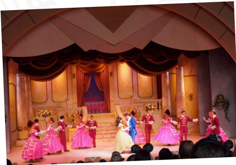
Beauty and the Beast Play

it is like its name, I seems like into another world which is completely separate from Orlando. Walt Disney World includes four big theme parks, which are Magic Kingdom, Animal Kingdom, Epcot and Hollywood Studio. The most popular one called Magic Kingdom, where is famous for its Main Street, USA. This street is made up of diverse architectural styles from around the USA, such as New England and Missouri. At the end of the Main Street is Cinderella's Castle, which is the most prominent building of the Magic Kingdom. When night falls, you can see the colorful lights reflecting the castle.