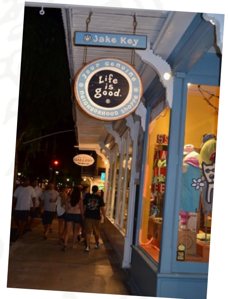
Duval Street, Key West

We spent seven days in Miami, appreciating the mixed culture between