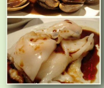
Food! Food! Food!