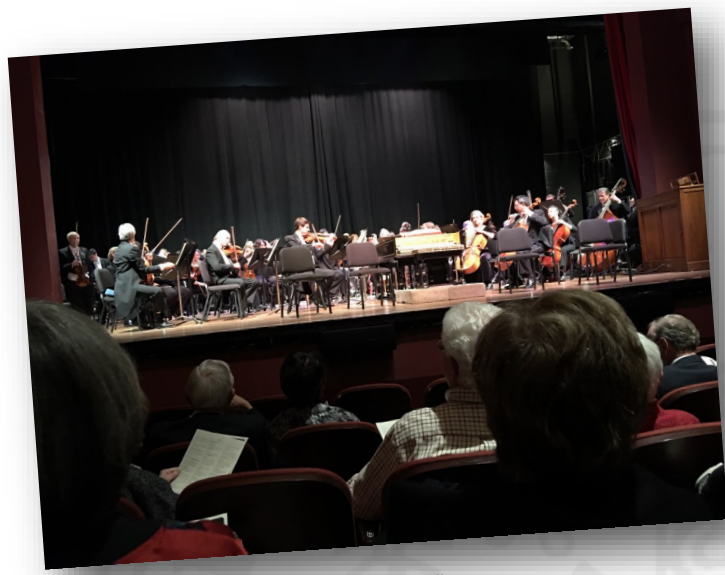
Musicians on Stage

As an international student, we sometimes feel lonely, because we are far away from our homes. Our school is afraid that we miss our homes too much and cannot take care of ourselves very well, so they match us with a mentor family. These families live in Chestertown and are willing to take care of us. I am lucky that I was matched with a mentor family. As a purpose to know each other further, my mentor family invited me to have dinner with them and go to enjoy a concert.