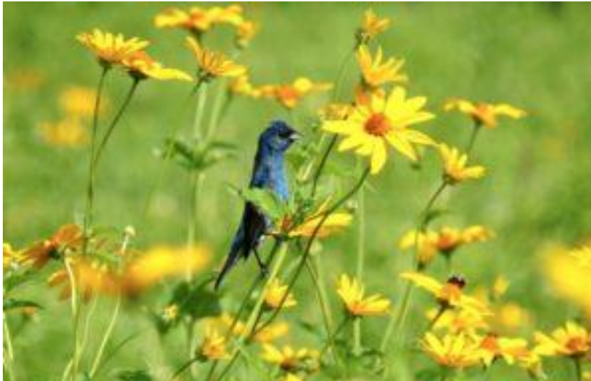
Male Indigo Bunting in a wildflower meadow planted in 2016 by NLP.

The Natural Lands Project is looking for landowners interested in setting aside marginal cropland to help declining Northern Bobwhites. Since 2015 we have been working throughout Kent and Queen Anne's Counties, in addition to these current efforts we would also like to target two areas that currently have small quail populations. These two areas, one each in Kent and Queen Anne's, have some existing habitat, but we could have a major positive impact on the quail population by installing additional acres of nesting and brood rearing habitat. In Queen Anne's we are looking to work with landowners along Lands End Road from Southeast Creek south to the Corsica River and in Kent, farms between Betterton and Still Pond (see accompanying maps).