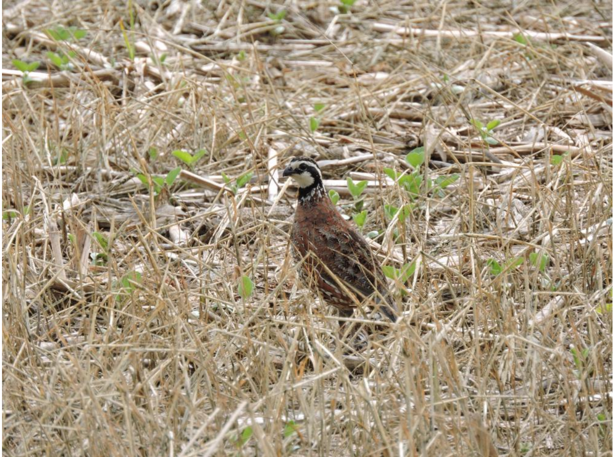
Male Northern Bobwhite on Chino Farms.

On Chino Farms there is a thriving native bobwhite population, in fact, now the largest in Maryland. This is a result of well-managed grasslands and early successional habitat that weave throughout a for-profit conventional agricultural operation. Since 1999 when marginal areas of row crops were converted to native habitat, these grasslands have reduced an estimated 80 lbs phosphorus, 1200 lbs nitrogen and 40,500 lbs of sediment from entering our local waterways annually. Our experience and results on Chino make us confident that habitat is the key missing ingredient for quail to once again to thrive on the Shore. As an Eastern Shore community we now need to work on landscape-level change, installing and managing grasslands and wetlands alongside of our farming priorities.