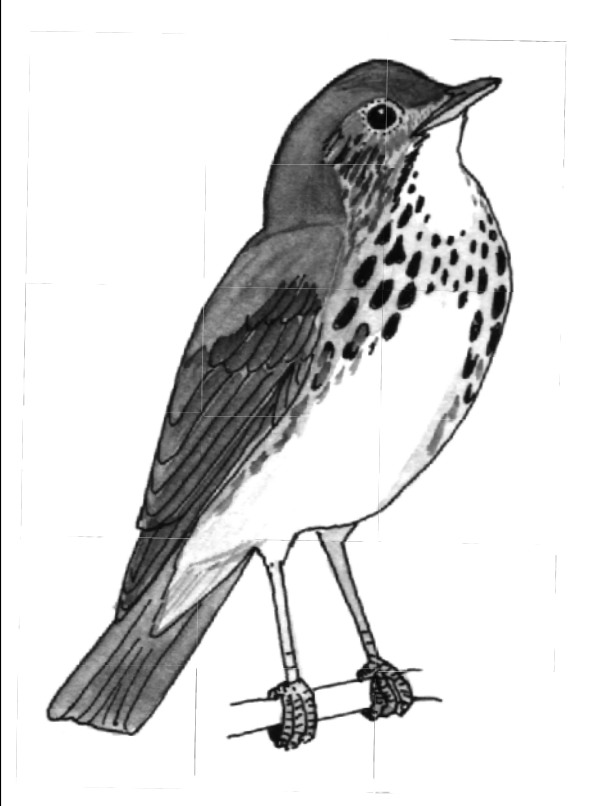
Hermit Thrush by George West