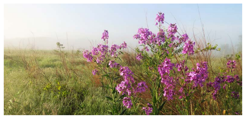
Left: Field Sparrow chicks in their nest. Above: a foggy morning in the grass-lands. Bottom: interns observe sparrow behavior.

We continue to conduct both breeding season and fall covey counts for Northern Bobwhite. Dan Small, Natural Lands Project Coordinator leads these efforts. The number of calling males heard in summer 2018