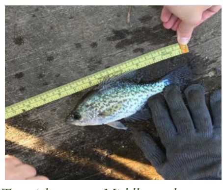
Top: tick surveys. Middle: students measure seed dispersal. Bottom: measuring fish.

used to monitor birds and avian populations.