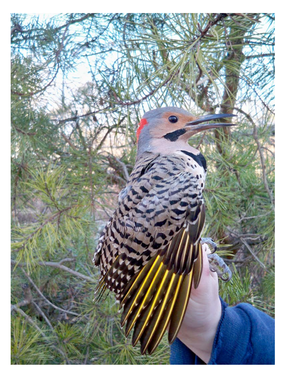
Yellow Shafted Flicker

Robins form these flocks in late summer to forage for food before migrating south in September and October. Some robins winter in this area but they are usually birds from nesting areas further north. Kingstown is 3 miles west of Foreman's Branch and this bird was 2 years 2 months old at the time it died.