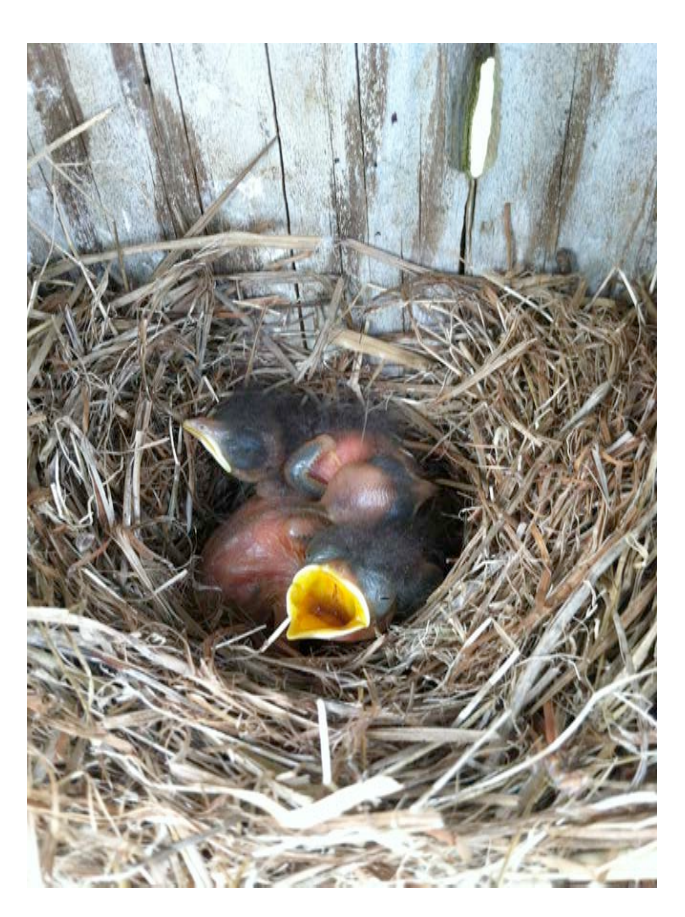
Nestling Eastern Bluebirds

As mentioned five other bird species utilized the nestboxes this season. There were 5 chickadee nests that fledged 15 chicks and one Carolina Wren nest that fledged 3 chicks. One pair of House Wren nests nested twice in the same box and each nesting attempt fledged 5 chicks for a total of 10. There were also 4 titmouse nests that fledged 11 chicks. A pair of Great-crested Flycatchers did build a nest and lay 5 eggs, but it was depredated. Although not mentioned in past years, the boxes do host non-avian species. There are mice which we evict, but there are also flying squirrels which we let stay. This year there were 3 boxes with squirrels in them.