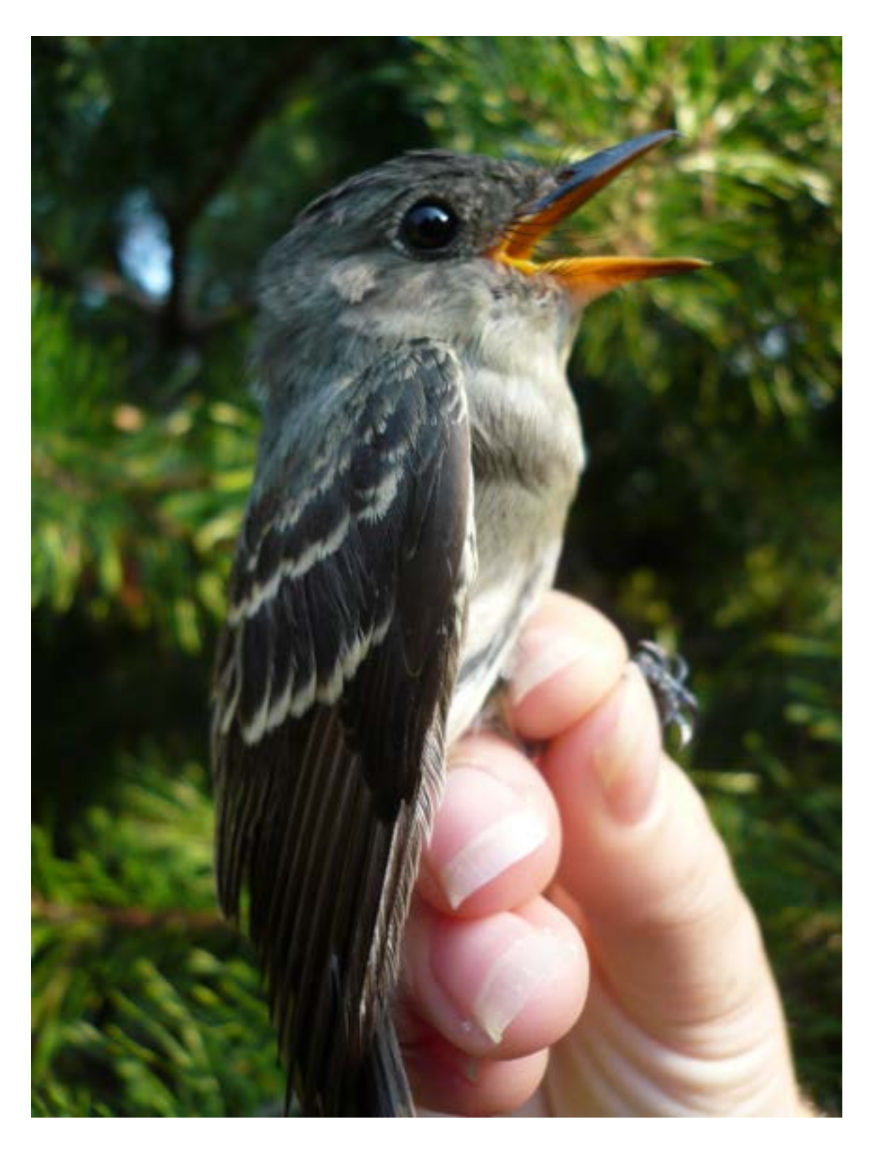
Eastern Wood Peewee