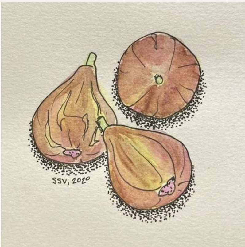
Artwork by Samina Soin-Voshell

Literature and documentaries regarding nature, conservation, and sustainability are some of the most accessible ways to educate oneself on the environment and current climate-related problems. Classic books like Silent Spring , Walden , Desert Solitaire , and The Everglades: River of Glass are beloved for their radical opinions on our relationship with the environment. More recent documentaries like Virunga , Before the Flood , Our Planet , and Sustainable are both educational and entertaining. This year we're thankful for accessible education and increased environmental awareness.