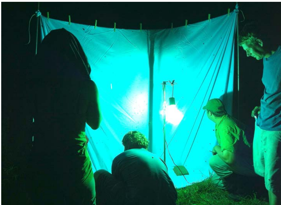
Left: Looking at insects. Above: Augochloropsis metallica.